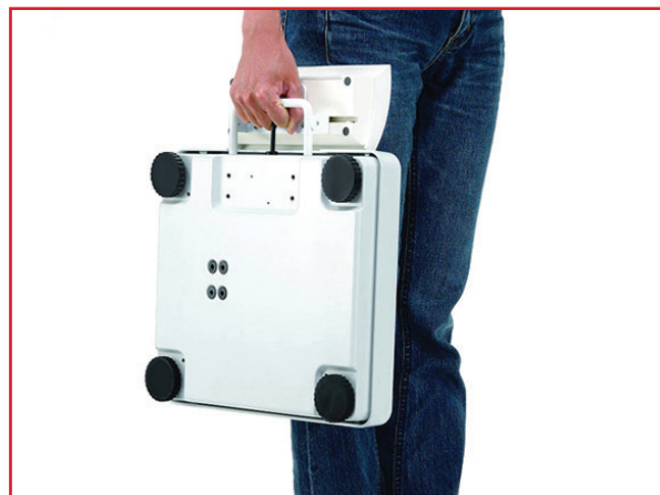
Ergonomic Carry Handle